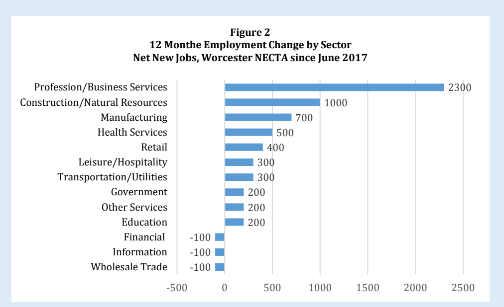
Figure 2 shows the net number of jobs added for each employment sector in the greater Worcester area over the past 12 months. Most sectors added jobs and the three that didn't saw fairly small declines in the actual number of jobs.

professional/business service sector its share of local employment (10.5%) is well below the statewide share in that sector (16.2%).