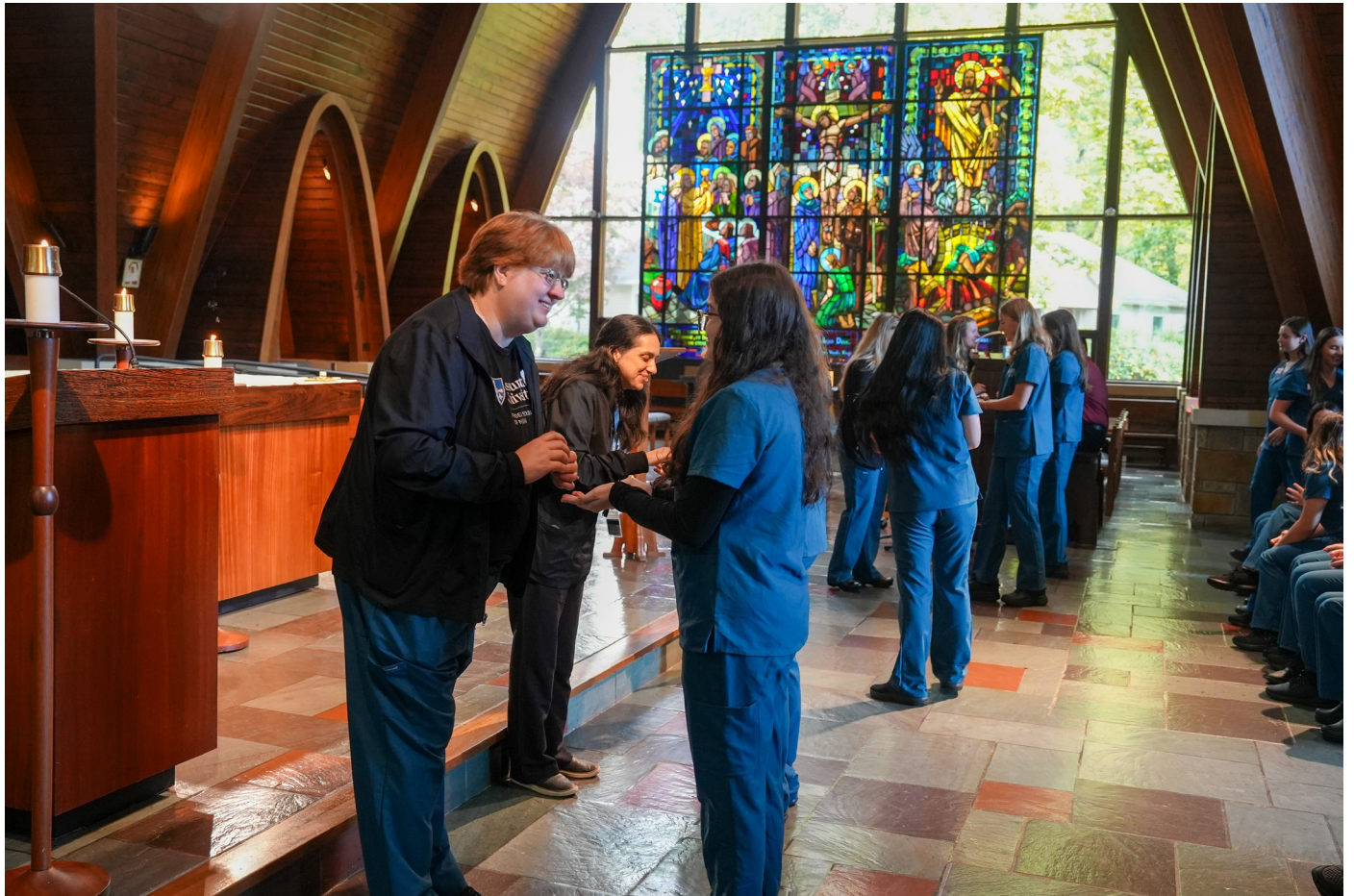
2025 annual Blessing of the Hands ceremony