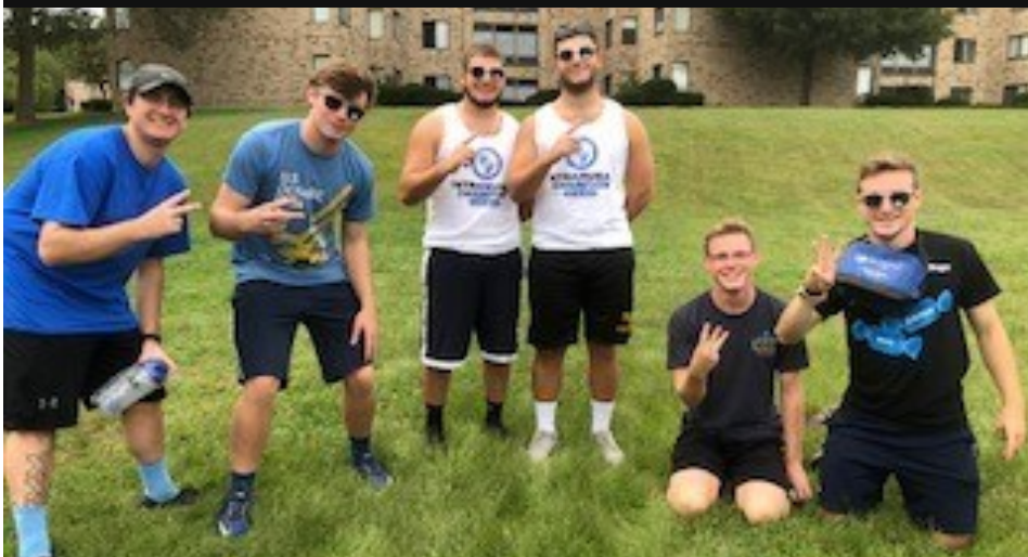
Absolute Units - Lawn Games Champions