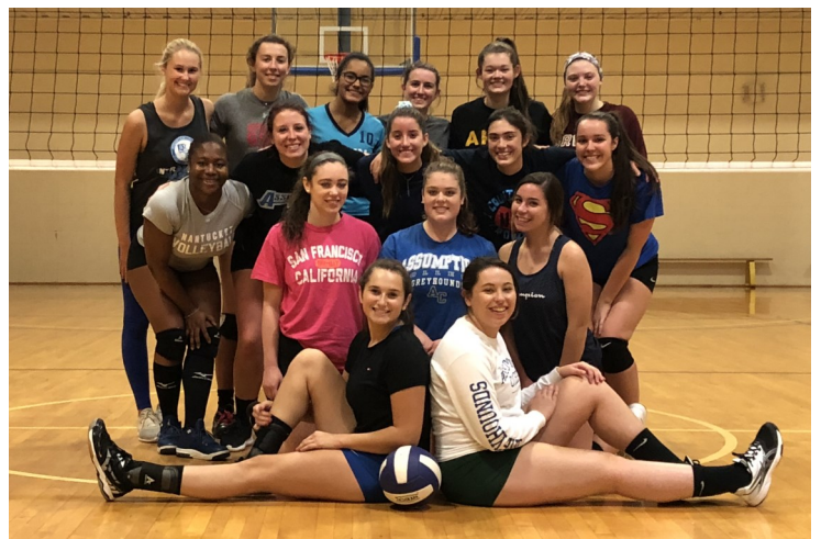
2018-19 Women's Club Volleyball Team

This semester, we will be hosting a tournament here at Assumption! Tournaments are all-day events that provide great opportunities to bond with teammates and compete at a high level. Come out and support us in the Plourde on November 4th!