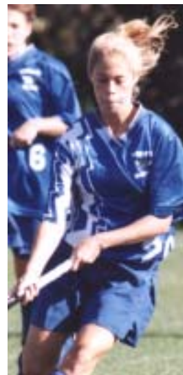
both the women's soccer and field hockey teams have won E.C.A.C. titles in the last five years!