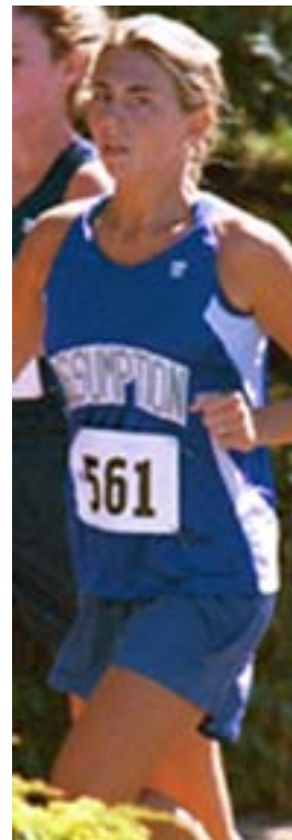
the Greyhounds are at the National Catholic Cross-Country championships at the University of Notre Dame in September!